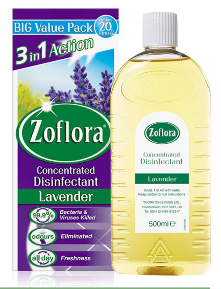
Thornton & Ross product Zoflora disinfectant

Thornton & Ross' impressive list of household trade names includes the UK's leading disinfectant Zoflora along with cough medicine Covonia, Cetraben cream for dry, sensitive or eczema-prone skin and Hedrin which gets rid of head lice.