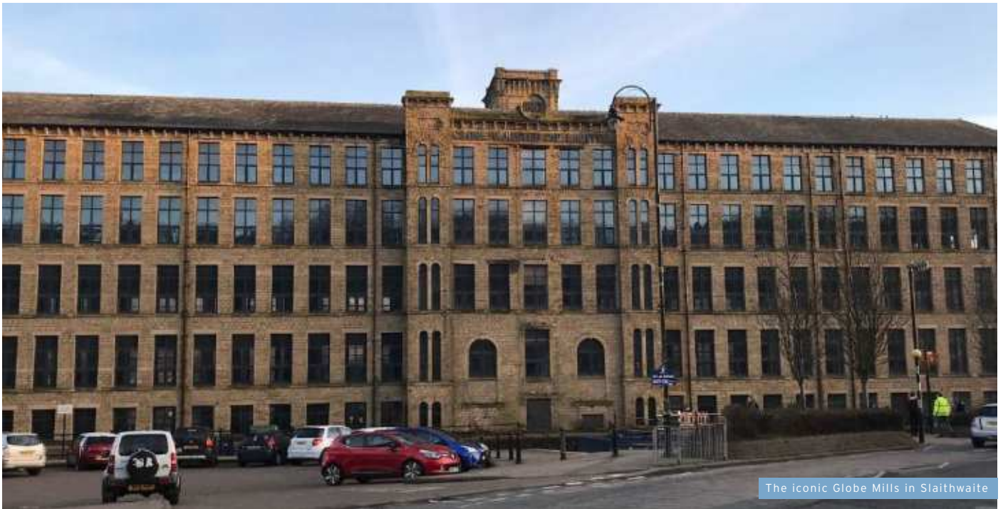
The iconic Globe Mills in Slaithwaite