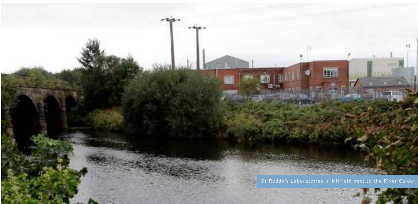
Dr Reddy's Laboratories in Mirfield next to the River Calder