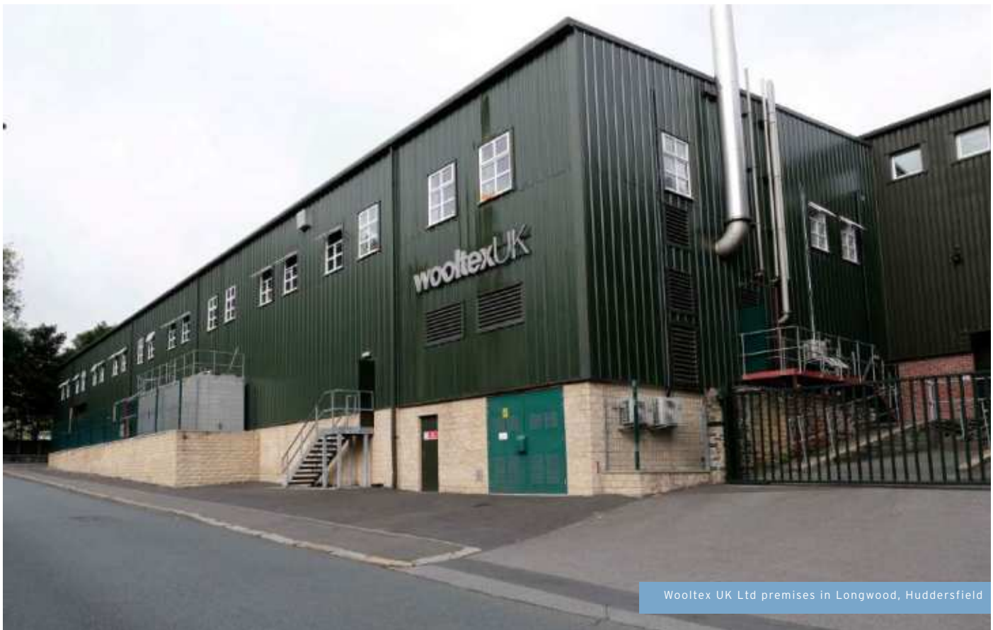
Wooltex UK Ltd premises in Longwood, Huddersfield

meet soaring demands. Wooltex UK is now one of the most modern textile manufacturing mills in the UK. The company states: "It is our policy to use approved local suppliers wherever possible in the manufacture of our products and we insist products from external suppliers are made to the same exacting standards we set for ourselves. Our local approach ensures fast, high quality production and minimises costs, as well as reducing the impact of our carbon footprint."