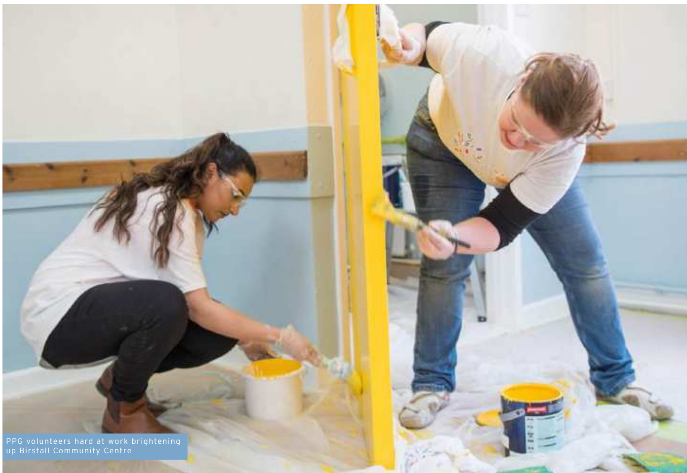
PPG volunteers hard at work brightening up Birstall Community Centre

T he PPG plant in north Kirklees is Europe's largest paint manufacturing complex.