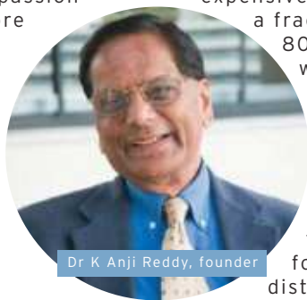
Dr. K Anji Reddy, founder

The company globally was set up by Indian-born scientist, philanthropist and entrepreneur Dr K Anji Reddy in 1984, powered by his passion to make medicines more affordable. He was also inspired by the pioneering spirit of the first American astronauts to land on the moon. The company was established in the UK in 2002 and is committed to saving the NHS money with its range of prescription medicines that includes gastrointestinal, neurology, cardiovascular, pain management, oncology and anti-infection. The company's ethos is to find innovative solutions that address the unmet needs of patients and accelerate access to much-needed medicines to large numbers of