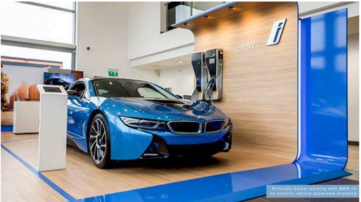
Principle Global working with BMW on its electric vehicle showroom branding

"Each country needs to be viewed through the lens of its own market conditions and with local teams who ensure that we are relevant wherever we do business."