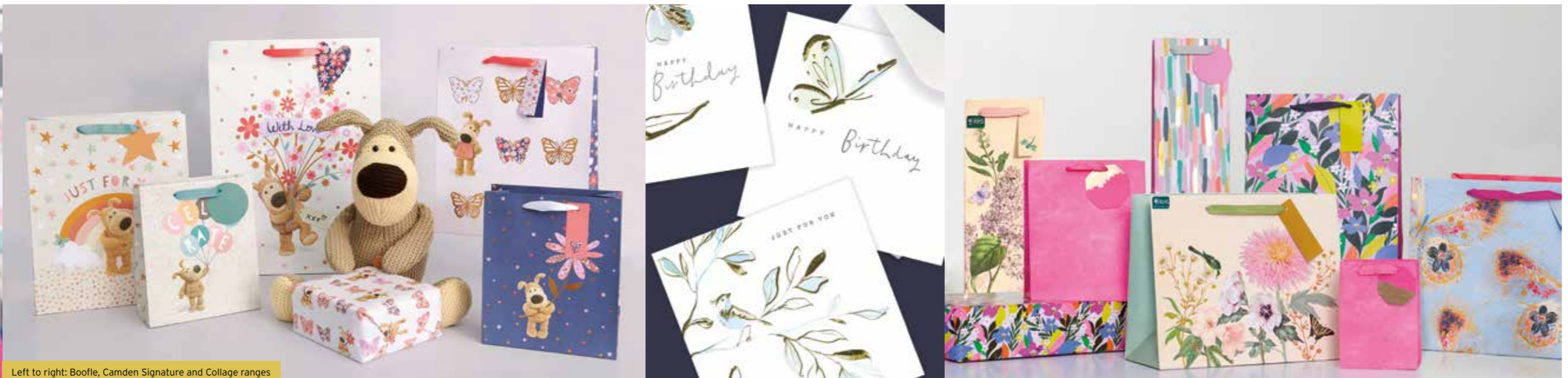
Left to right: Boofle, Camden Signature and Collage ranges